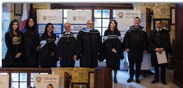
Some of the members of Faculty and students present at the 2022 Advenio eAcademy Graduation event.

The accreditation of the course provides the confirmation of European quality assurance and the automatic recognition of the course within the EU. The collaborating Higher Educational Institutions bring to the programme years of international experience at graduate level and include some very well-known European universities. This international involvement is what distinguishes the proposed programme most. It provides a uniquely European open approach to learning, focusing on the on-going development of best practices in the different fields related to entrepreneurship. The Level 7 Masters in Entrepreneurship programme is offered fully online, or via blended learning for residential students in Malta.