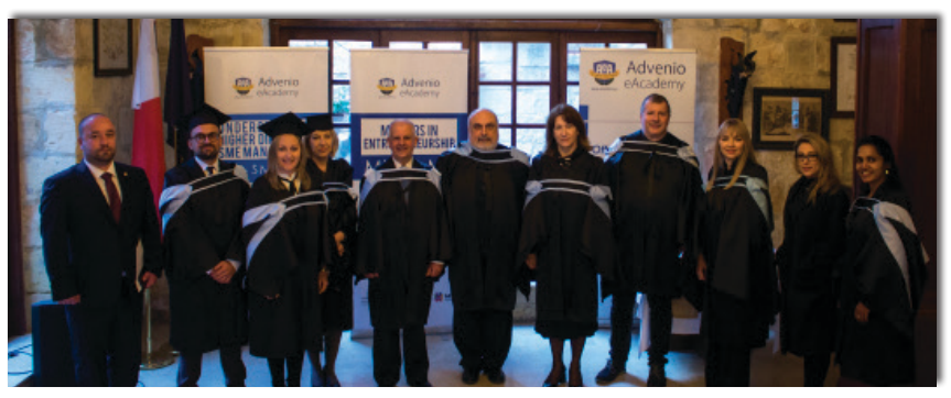
Some of the members of Faculty and students present at the 2022 Advenio eAcademy Graduation event (above)

Some of the members of Faculty and students present at the 2019 Advenio eAcademy Graduation event (above)