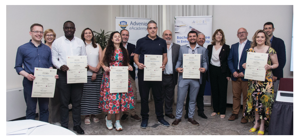
Some of the members of Faculty and students present at the 2023 Bachelor's Degree in Entrepreneurship Graduation event held in Malta (above)

Advenio eAcademy develops local and international collaborations with Higher Education Institutes, professional bodies, NGOs and private sector firms, to develop customised elearning solutions which meet the requirements of specific market seaments and user groups."