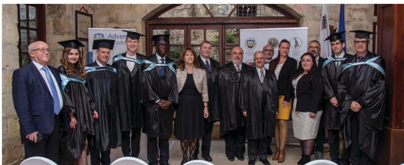
Some of the members of Faculty and students present at the 2019 Advenio eAcademy Graduation event (above)

The accreditation of the course provides the confirmation of European quality assurance and the automatic recognition of the course within the EU. The collaborating Higher Educational Institutions bring to the programme years of international experience at graduate level and include some very well-known European universities. This international involvement is what distinguishes the proposed programme most. It provides a uniquely European open approach to learning, focusing on the on-going development of best practices in the different fields related to entrepreneurship.