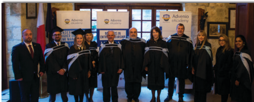
Some of the members of Faculty and students present at the 2022 Advenio eAcademy Graduation event (above)